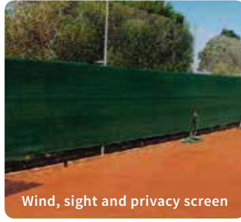
Wind, sight and privacy screen