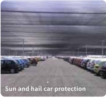
Sun and hail car protection